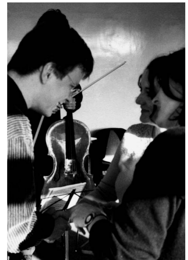
Vogler Quartet, Post Primary Music Education Workshop, Convent of Jesus and Mary, Enniscrone, Co. Sligo, 2000.

For future reference, teachers proposed more frequent opportunities for direct contact between the children and the musicians, in order to build relationships further and enhance opportunities for creative interaction.