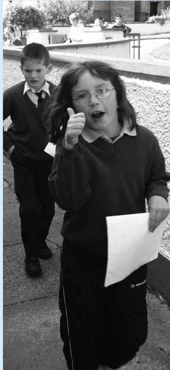
Thumbs up from one of the children arriving for a Vogler Quartet, Music Education Workshop, Riverstown, 2003.