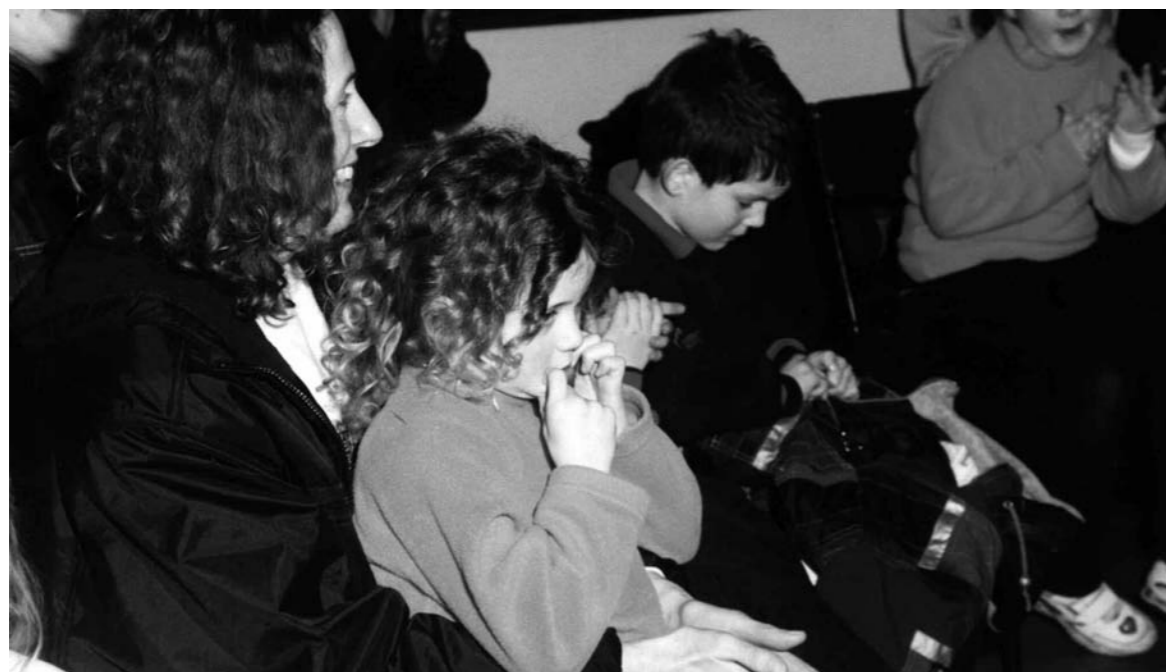
Mother and child enjoying a Vogler Quartet, Music Education Workshop, Riverstown Hall, 2001.

In the context of this research, which highlights the need for further specialised training for musicians interested in working in educational settings, it is interesting to note Music Network's commitment to the further development of Continuing Professional Development training and mentoring opportunities. Collaboration in this area could give rise to mutual learning and resource building 57 at all levels, with valuable experience and resources to be found among the members of the Vogler primary curriculum support team, The Arts Council and Mary Immaculate College of Education, University of Limerick.