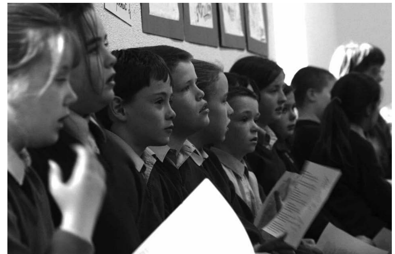
Children participating in a Vogler Quartet, Music Education Workshop, Soeey, 2003.

At national level, it is hoped that this report will contribute to a developing understanding of the nature and value of artists' residencies as effective mechanisms for local music education and development, and that its dissemination will help to inform future planning and provision not only in music but across a range of art forms.