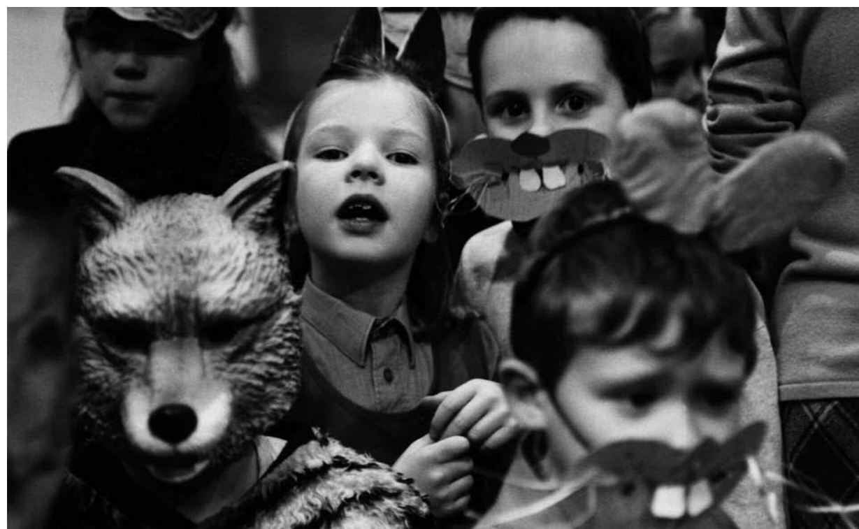
Children from S.N. Molaise, Grange preparing for a performance during a Vogler Quartet, Music Education Workshop, 2002.

- Advocacy for a national music day - Following the success of the Vogler residency, one teacher suggested advocating for a national music day. This would help to provide the 'focus' on music that was so important in the residency and would encourage information sharing and engagement of local music resources.