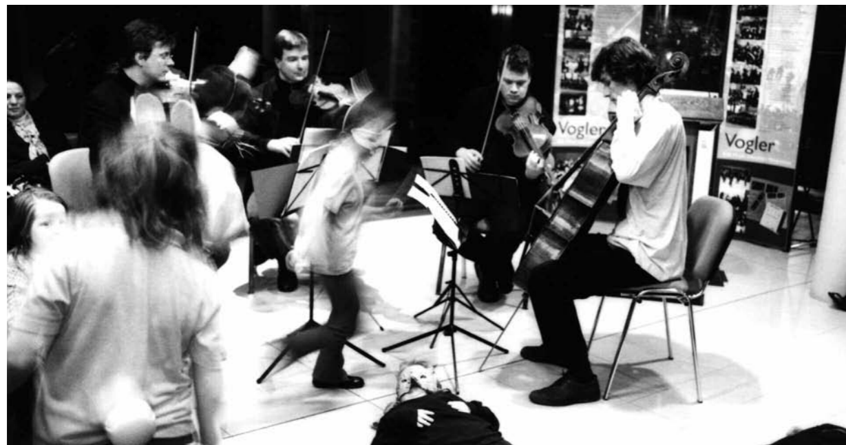
Children Performing at the launch of the Vogler Spring Festival, Sligo County Hall, 2001.

For future reference, teachers with varied levels of confidence and musical expertise all suggested further emphasis and support in the area of composition.