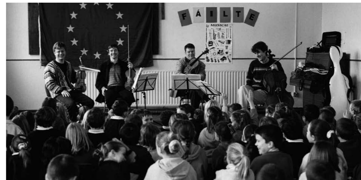
Vogler Quartet, Music Education Workshop, S.N. Realt Na Mara, Rosses Point, 2000.

Children who did attend the academy during the residency found their classroom encounters with the quartet significantly enhanced. Besides the opportunity to get to know the musicians better, they were invited to illustrate various musical points in the classroom and took an active part in collaborative performances with the quartet.