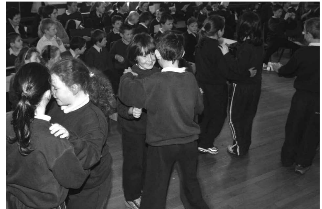
Children dancing at a Vogler Quartet, Music Education Workshop, Riverstown Hall, 2003.

programme was the introduction of a less familiar musical genre that would not have been selected by the majority of teachers if they had been given the choice. Some independence is required if the facilitator is to retain the freedom to inject elements of musical and educational challenge to live music programmes in schools, and this should be borne in mind when collaborative planning processes are being developed.