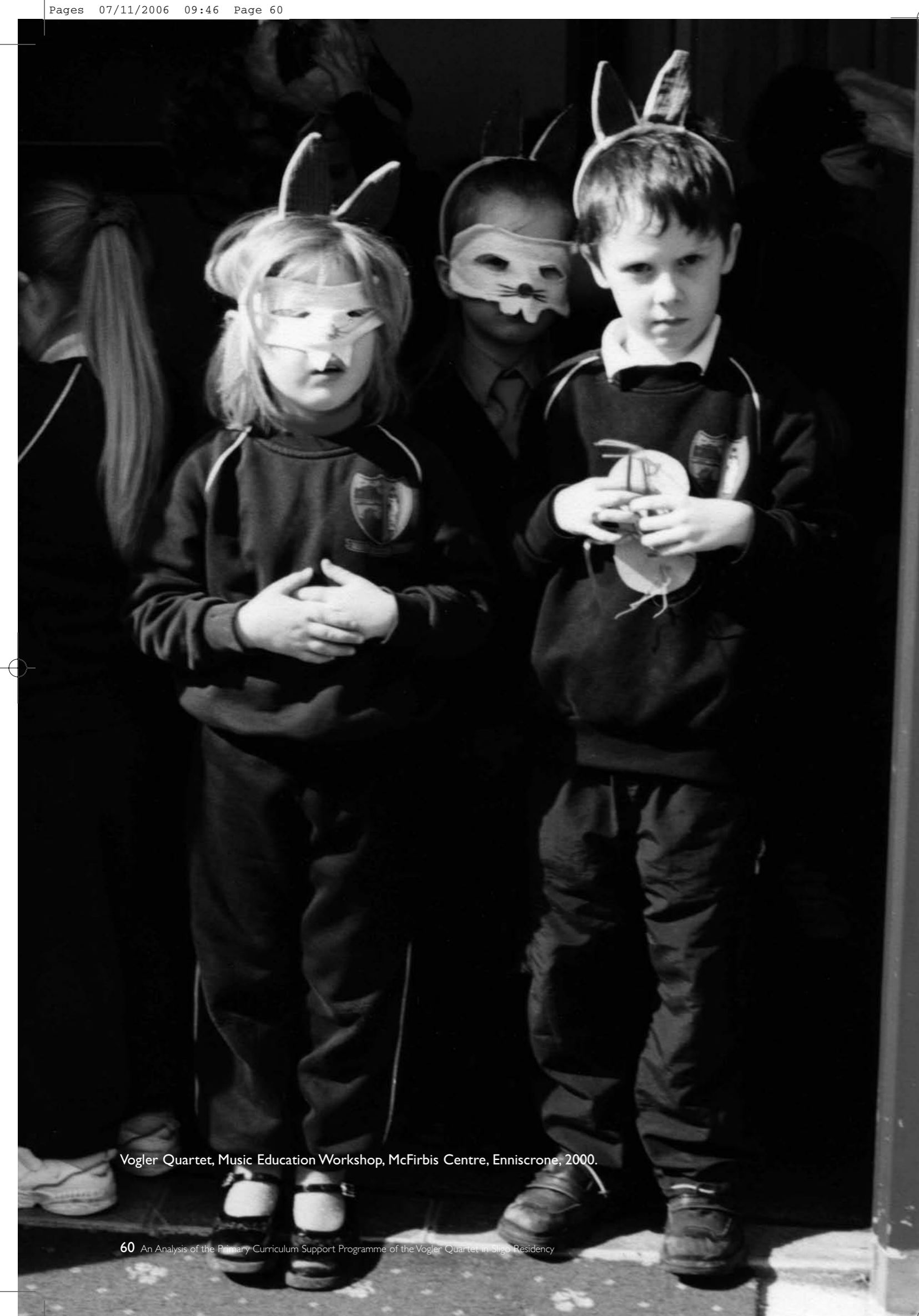
Vogler Quartet, Music Education Workshop, McFibbis Centre, Enniscrone, 2000.